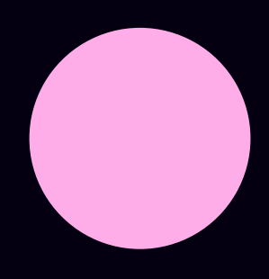
SECONDARY ACCENT #FFADE9